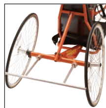
Drafting bumper is required for racing and will ensure that no one follows too close.