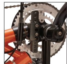
Adjustable crank height is standard on the Force G.