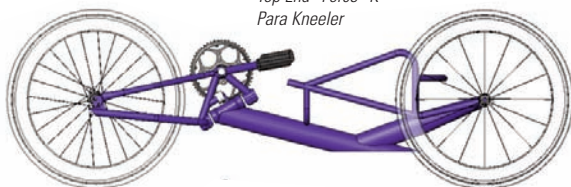
Top End® Force™ K Para Kneeler