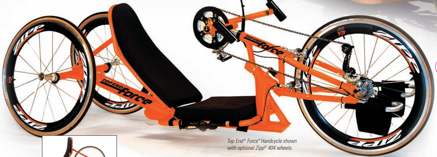
Top End ® Force ™ Handcycle shown with optional Zipp ® 404 wheels.