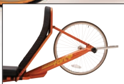
Back is adjustable from 35 to 55 degrees.