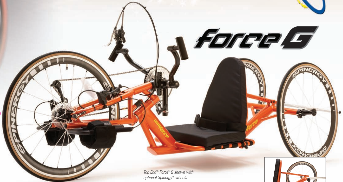
Top End® Force™ G shown with optional Spineray® wheels.