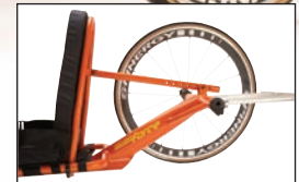
Back is adjustable from 55 to 90 degrees.