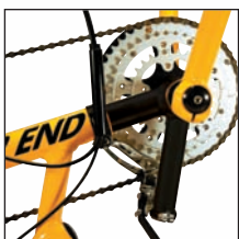
The manual upper derailleur system is easy-to-operate and takes the guess work out of the chain rings.

The aerodynamic Force™ G design offers an adjustable, trunk-powered, erect position for low paras, amputees, and competitors who can “gut” it out using abdominal, arm, shoulder and chest muscles. The Force G features the same internal rib center frame design as the Force to make it super stiff with easy transfers. The adjustable back angle (55-90 degrees), back height, leg rests, crank height and fore/aft seat position allow you to dial in your ultimate power position. Check out our professional series, cassette, brake and chainring upgrades and time trial wheel package for maximum performance and speed. Can you force the pace? Yes, you can*. Get the Top End Force G. You will fly like a jet.