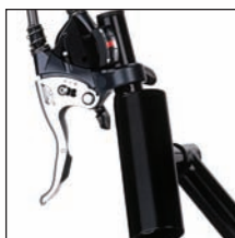
Shimano® RapidFire hands-on shifter/brake delivers smooth, responsive shifting and braking right at your fingertips.