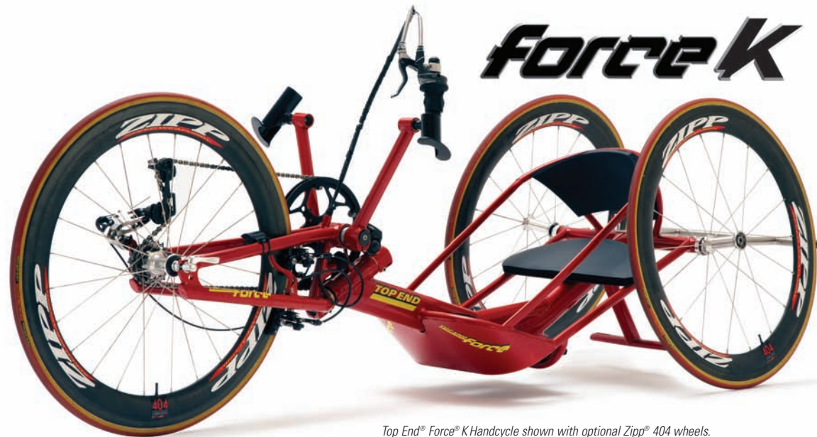
Top End® Force® K Handcycle shown with optional Zipp® 404 wheels.